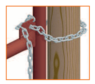
Posi-Lock chain latch