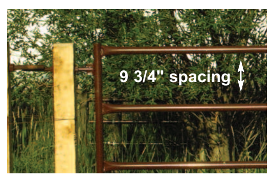
Length refers to size of opening. The length of the gate is actually 5 1/2" shorter. i.e.: 10' gate is actually 9' 6 1/2"